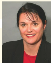
Affirming an Ethic of Care at the End of Life: Blending Quality with Compassion